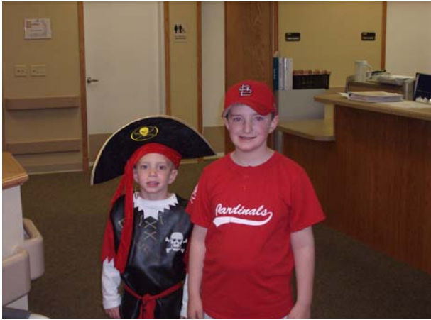
Children of employees dressed up for Beggar's Night and did some trick or treating at The Village. Around twenty children came!